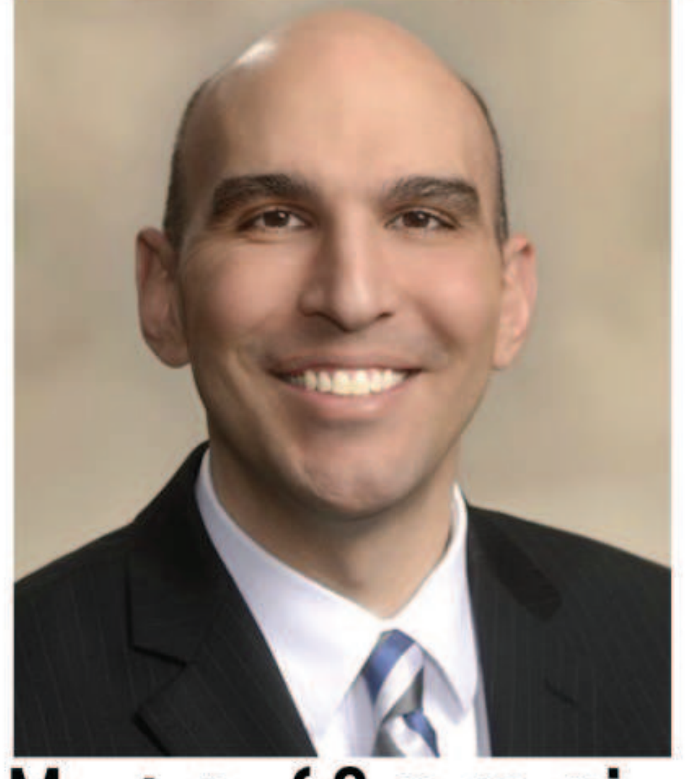
Master of Ceremonies