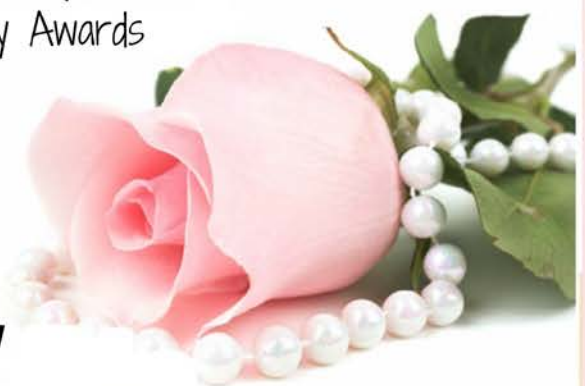
Table Sponsorships Available!