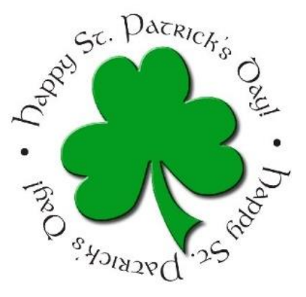
March 2019 Newsletter

Hello, Happy St Patrick's Day and Happy March Madness!