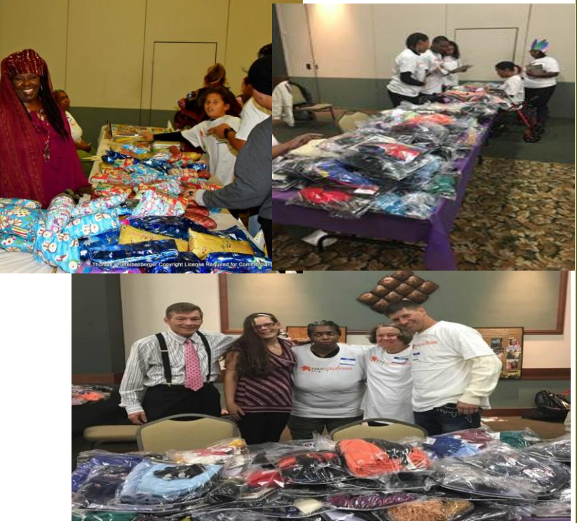
November 2019 Newsletter Save the Date!

Thanksgiving Day November 28, 2019 The Exchange Club of Dayton Lajna Imaillah Dayton in support of Circle of VisionKeepers, Inc. Annual Time to be Thankful and Grateful Event