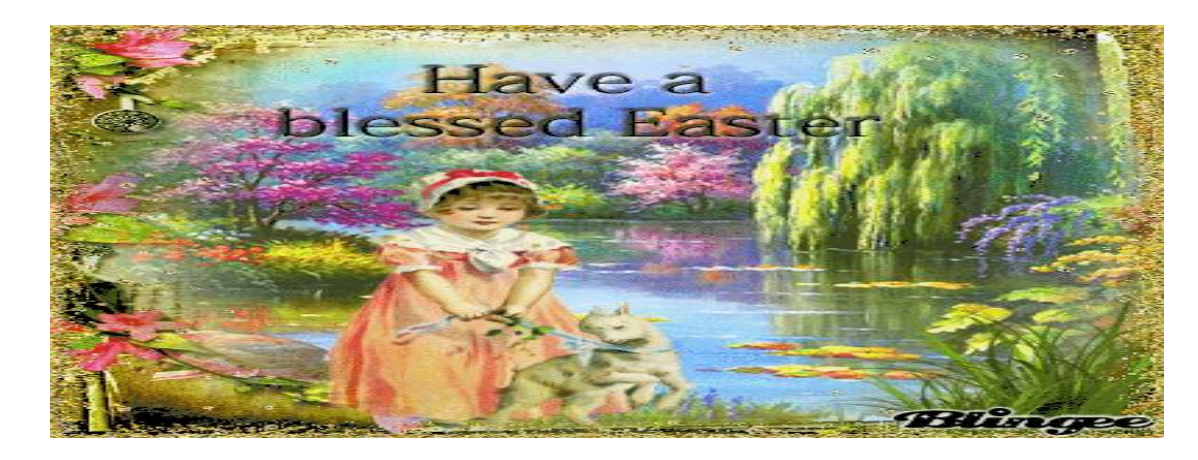
April 2019 Newsletter

"If we had no winter, the spring would not be so pleasant: if we did not sometimes taste of adversity, prosperity would not be so welcome."